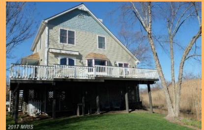
Deck at Blue Heron Studio, Rock Hall, MD