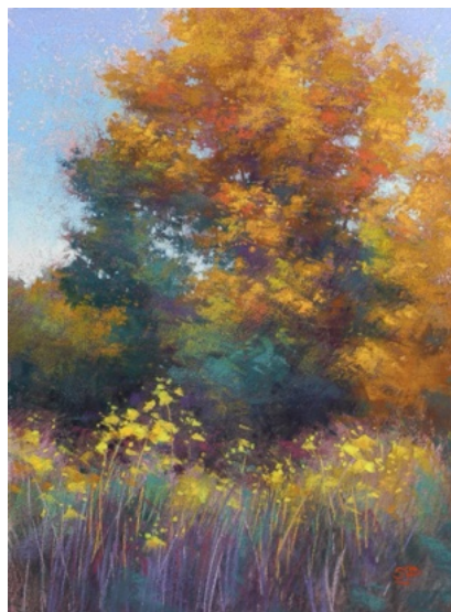
"Golden Rod, Golden Hour"

Stephanie explains, "I typically start each painting with a value study in charcoal and white pastel on toned paper in order to work out the composition and think carefully about big shapes and value masses. Sometimes I skip this step, but I almost always regret it when I do—I find compositional mistakes are the hardest ones for me to recover from."