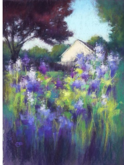
"In Full Bloom"

"I am very inspired by the natural world. I especially love painting plein air—there's just something about being outside, feeling the breeze and listening to the birds sing (and chatting with the occasional runner or hiker who stops by). My still lifes and florals are often painted from life using natural light, so it's more common for me to paint them in the spring and summer, when the days are longer. In the fall and winter I paint landscapes almost exclusively."